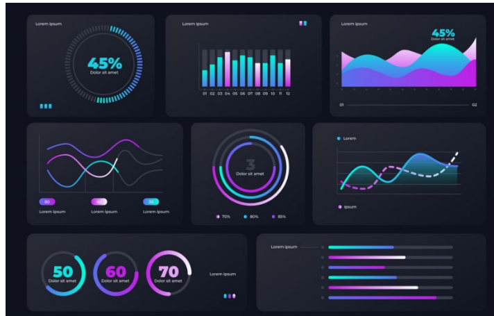
Figure 3: Data Visualization