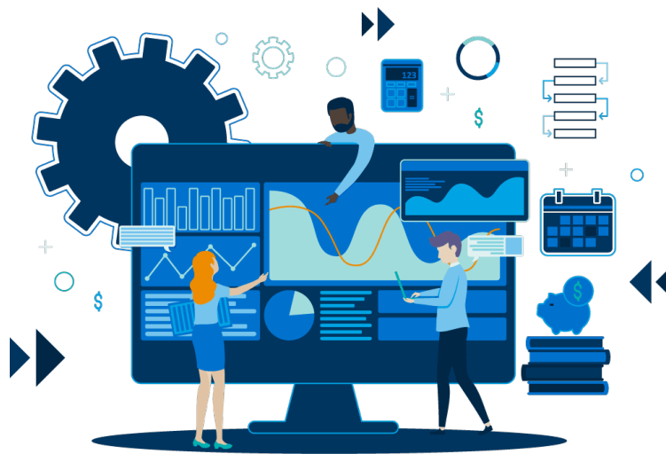
Figure 1: Predictive modelling

Predictive modeling is a powerful tool that can provide organizations with a competitive edge by allowing them to make data-driven decisions. Predictive modeling can be used in a variety of industries, including finance, healthcare, retail, and manufacturing. With the increasing availability of big data and advancements in AI and machine learning, organizations can leverage these technologies to create more accurate and efficient predictive models. By using predictive modeling, organizations can improve their operations, increase sales, and improve customer engagement, leading to a competitive advantage in today's data-driven world.