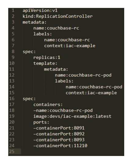
Figure 1: An example of Kubernetes code

These platforms and tools could also be divided based on the two major modelling approaches it takes: