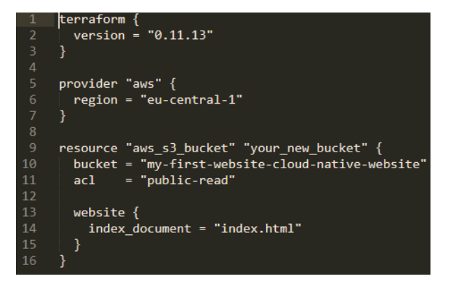
Figure 2: An example of declarative approach in Terraform

Below are two different ways to provision the same infrastructure. We will create an S3 bucket, first with Terraform (Figure 2), a declarative IaC tool. And second, with ad hoc scripts (Figure 3).